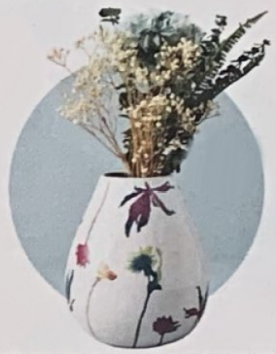
DRIED HYDRANGEA BOUQUET anthropologie.com, $28

Ever-blooming dried flowers and a textured throw serve as focal points with an organic feel.