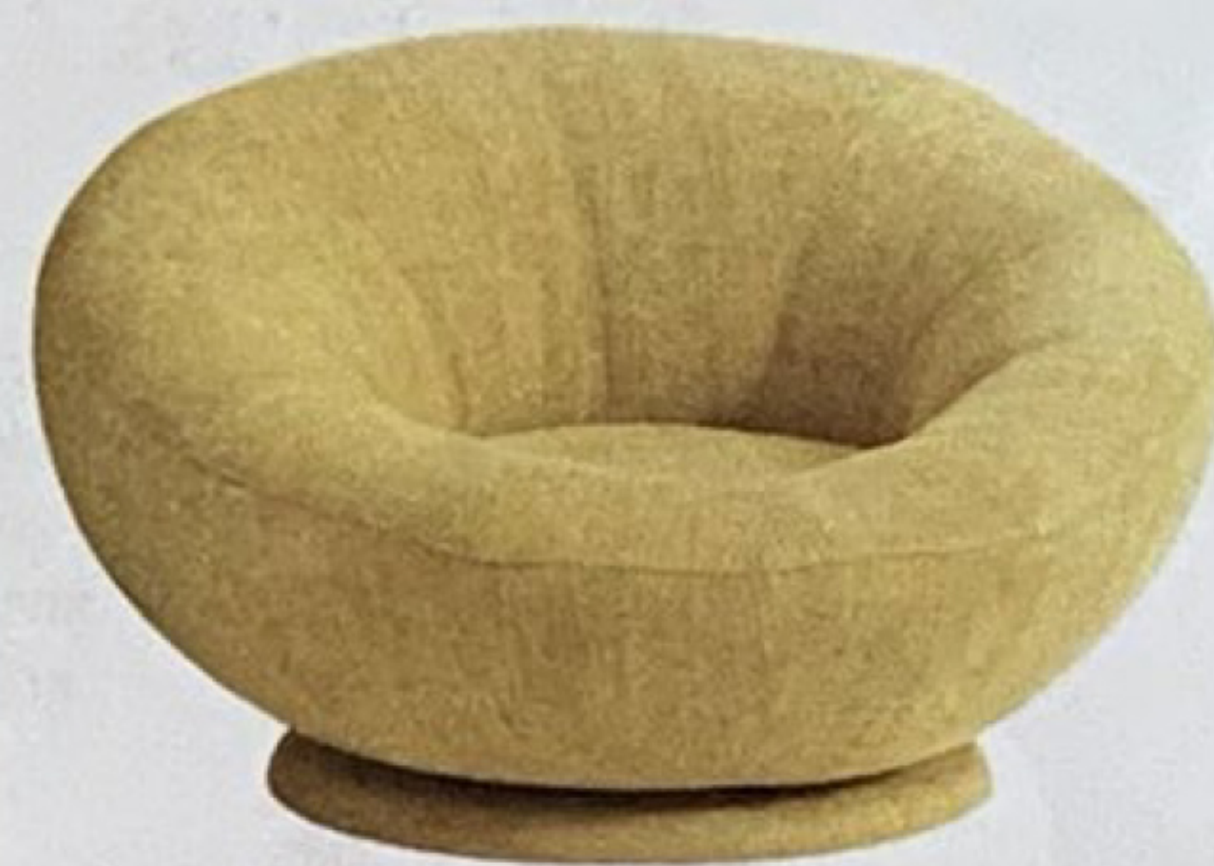
WEST ELM X PBT GROOVY SWIVEL CHAIR pbteen.com, $429