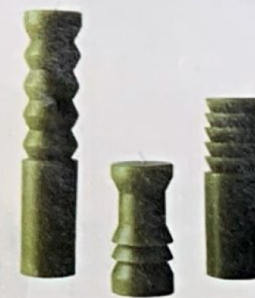
TOTEM CANDLE SET areaware.com , $48