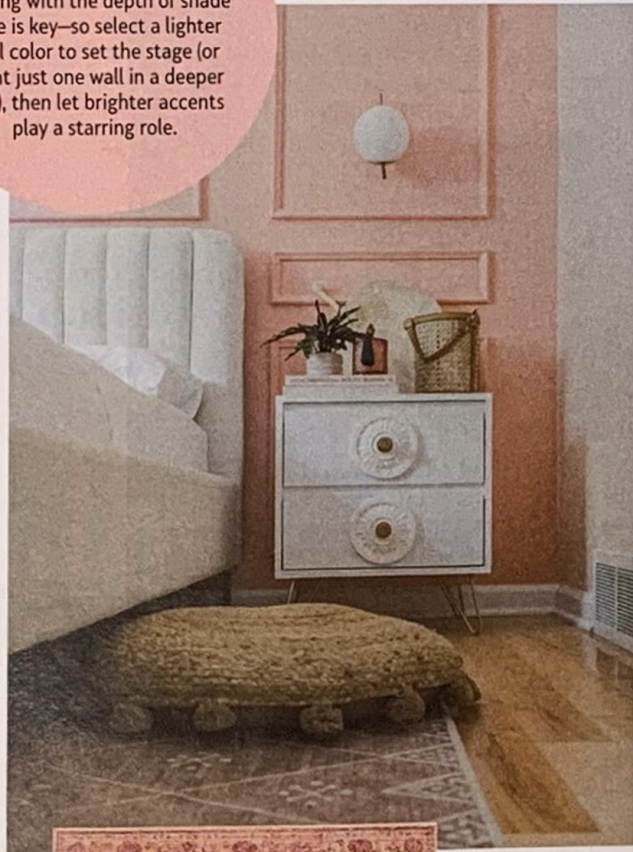
Tangerine Dream, behr.com