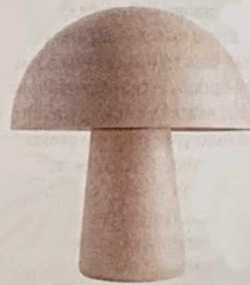
CLAY TABLE LAMP crateandbarrel.com , $129