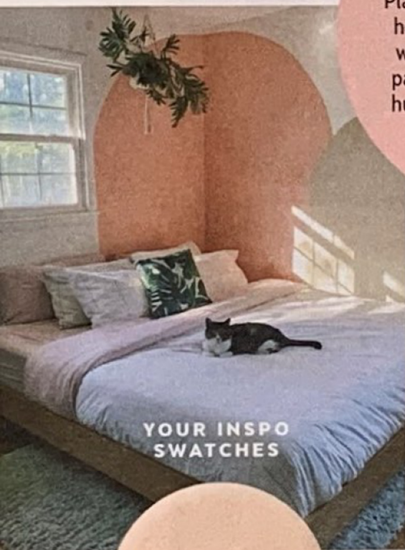
YOUR INSPO SWATCHES

Playing with the depth of shade here is key—so select a lighter wall color to set the stage (or paint just one wall in a deeper hue), then let brighter accents play a starring role.