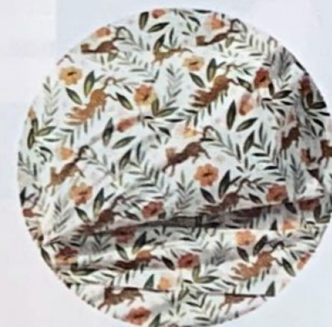
MARRAKECH TIGER SHEET SET crateandbarrel.com , $99