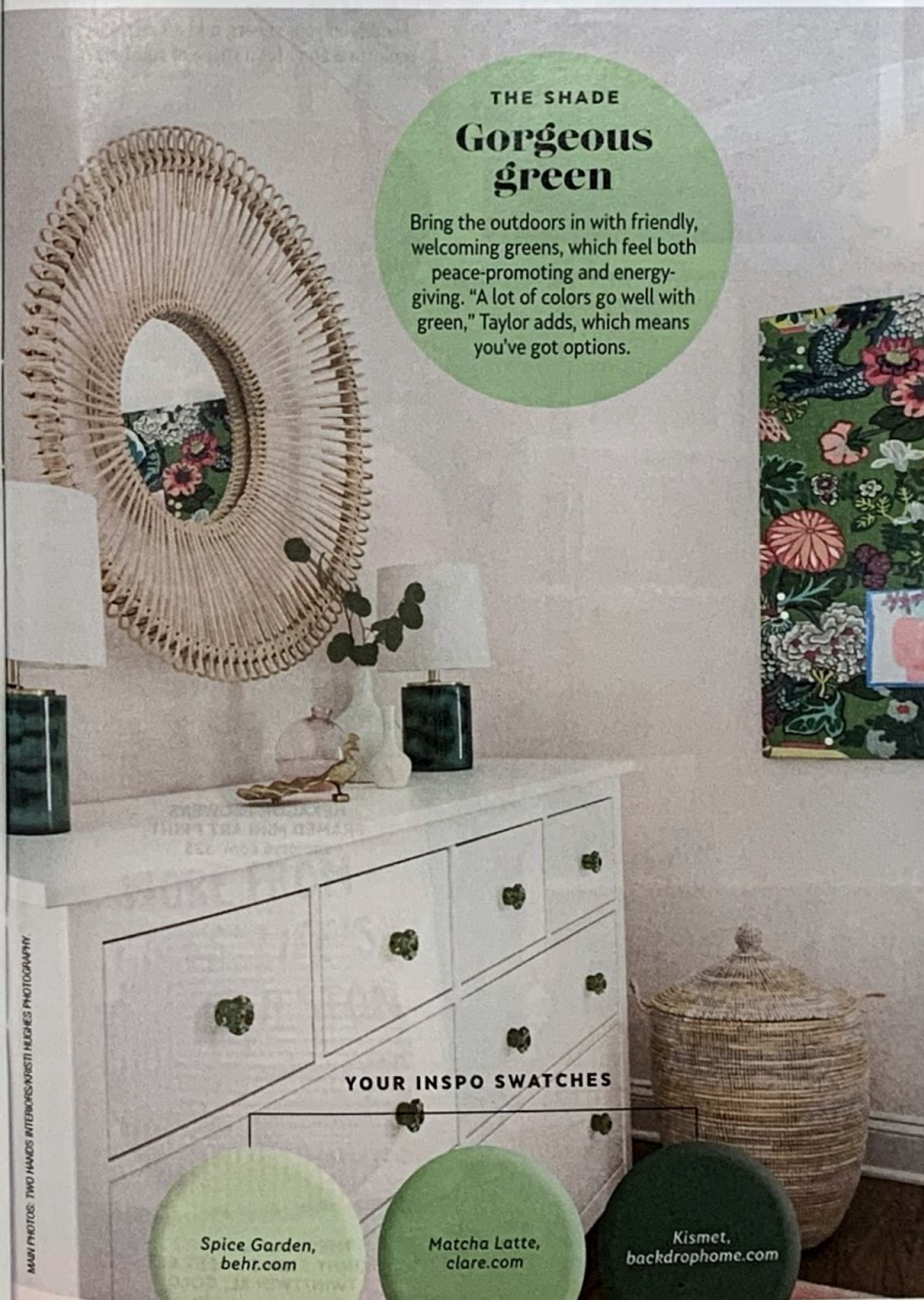
YOUR INSPO SWATCHES

Bring the outdoors in with friendly, welcoming greens, which feel both peace-promoting and energizing. "A lot of colors go well with green," Taylor adds, which means you've got options.