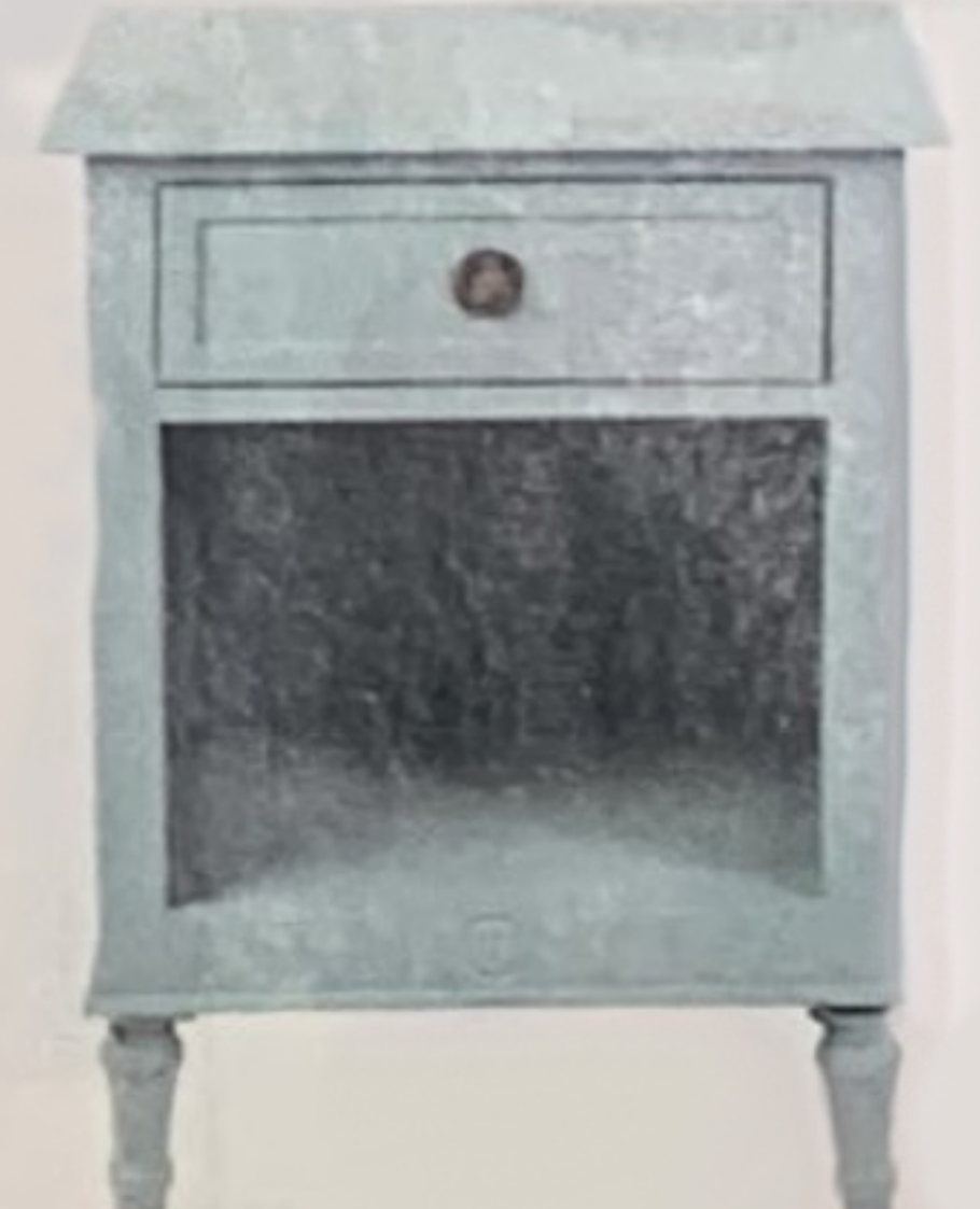
KELLY CLARKSON HOME NIGHTSTAND wayfair.com, $279