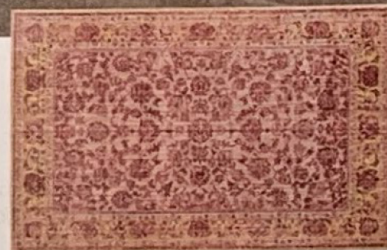
SAFAVIEH VALENCIA MUIREANN DISTRESSED RUG overstock.com , $81