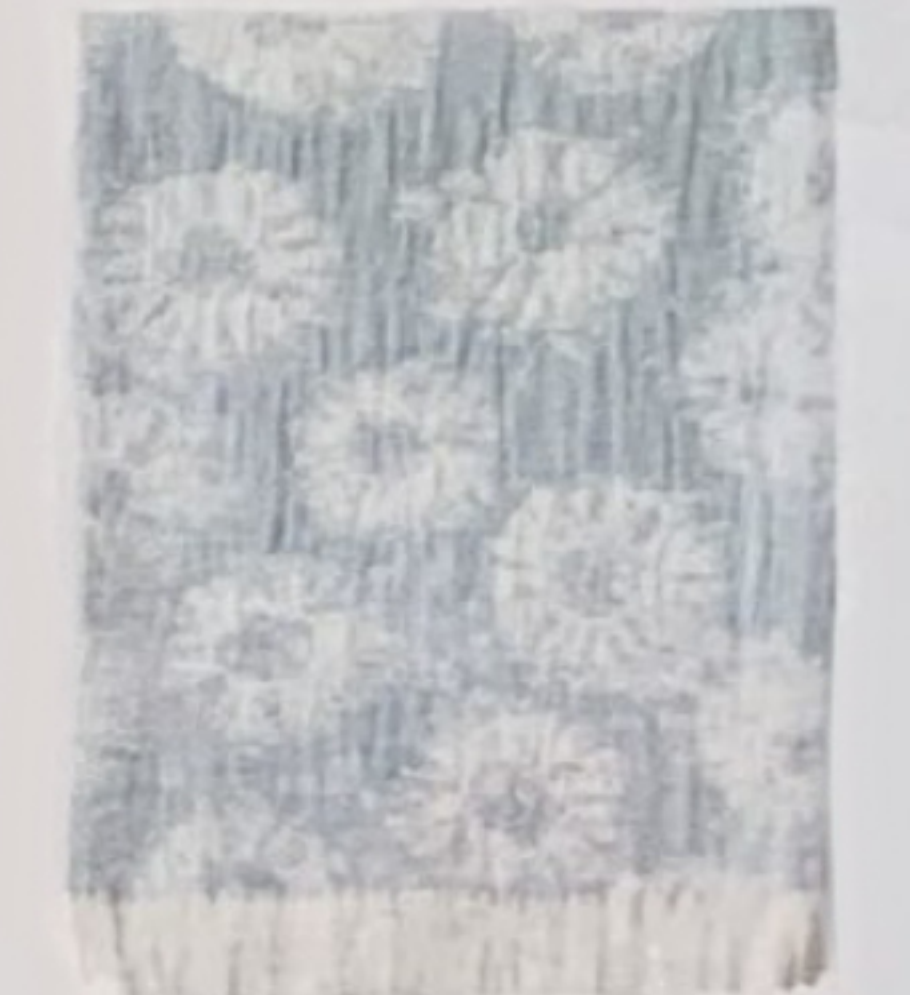
TIE-DYED SUMMER COTTON THROW thecompanystore.com, $109