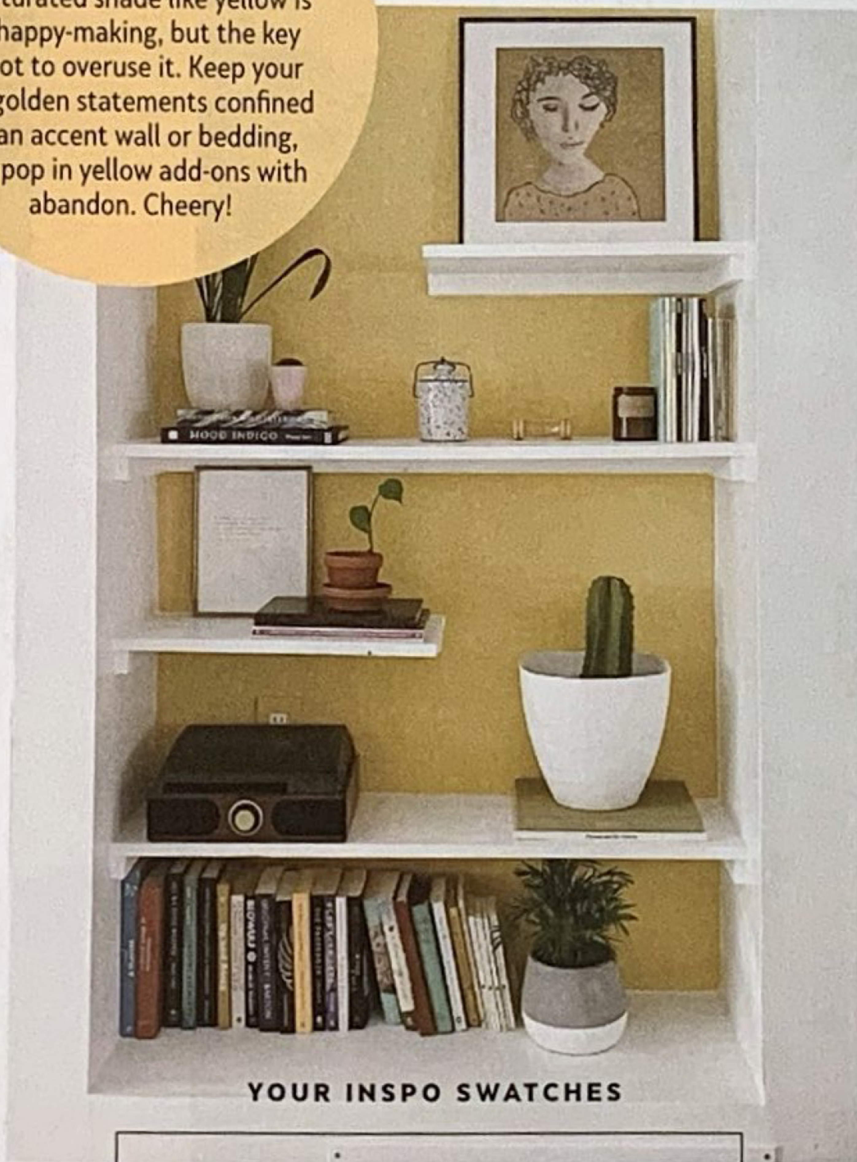
YOUR INSPO SWATCHES