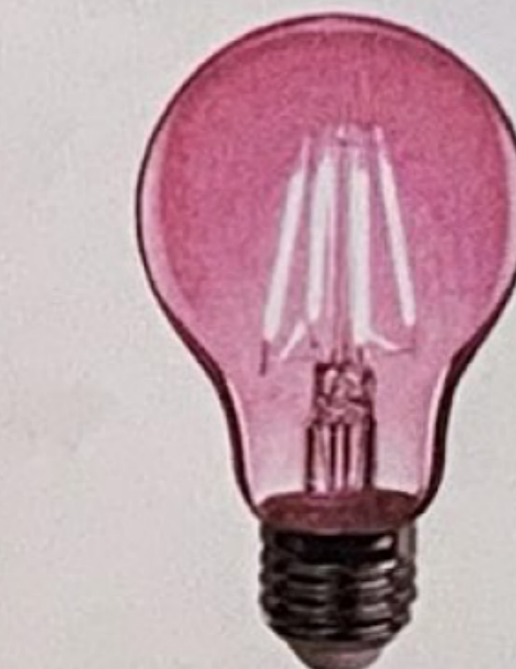
FEIT ELECTRIC PINK-COLORED BULB homedepot.com , $5