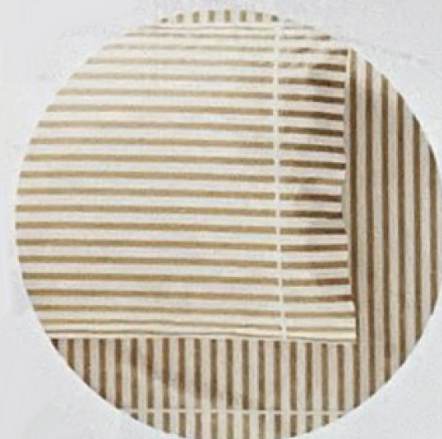
THE EMILY & MERITT SKINNY STRIPE SHEET SET, TWIN/TWIN XL, GOLD pbteen.com, $89