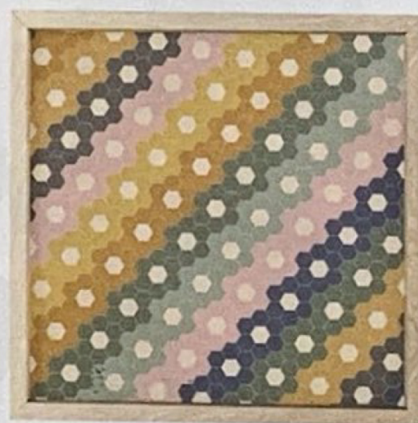
HEXAGON FLOWERS FRAMED MINI ART PRINT society6.com, $25