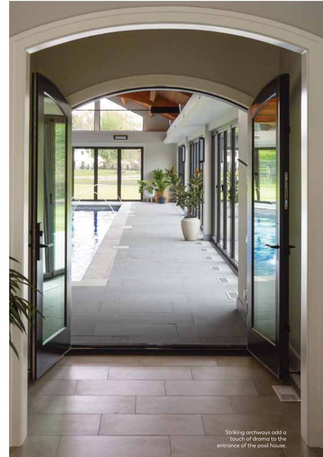
Striking archways add a touch of drama to the entrance of the pool house.