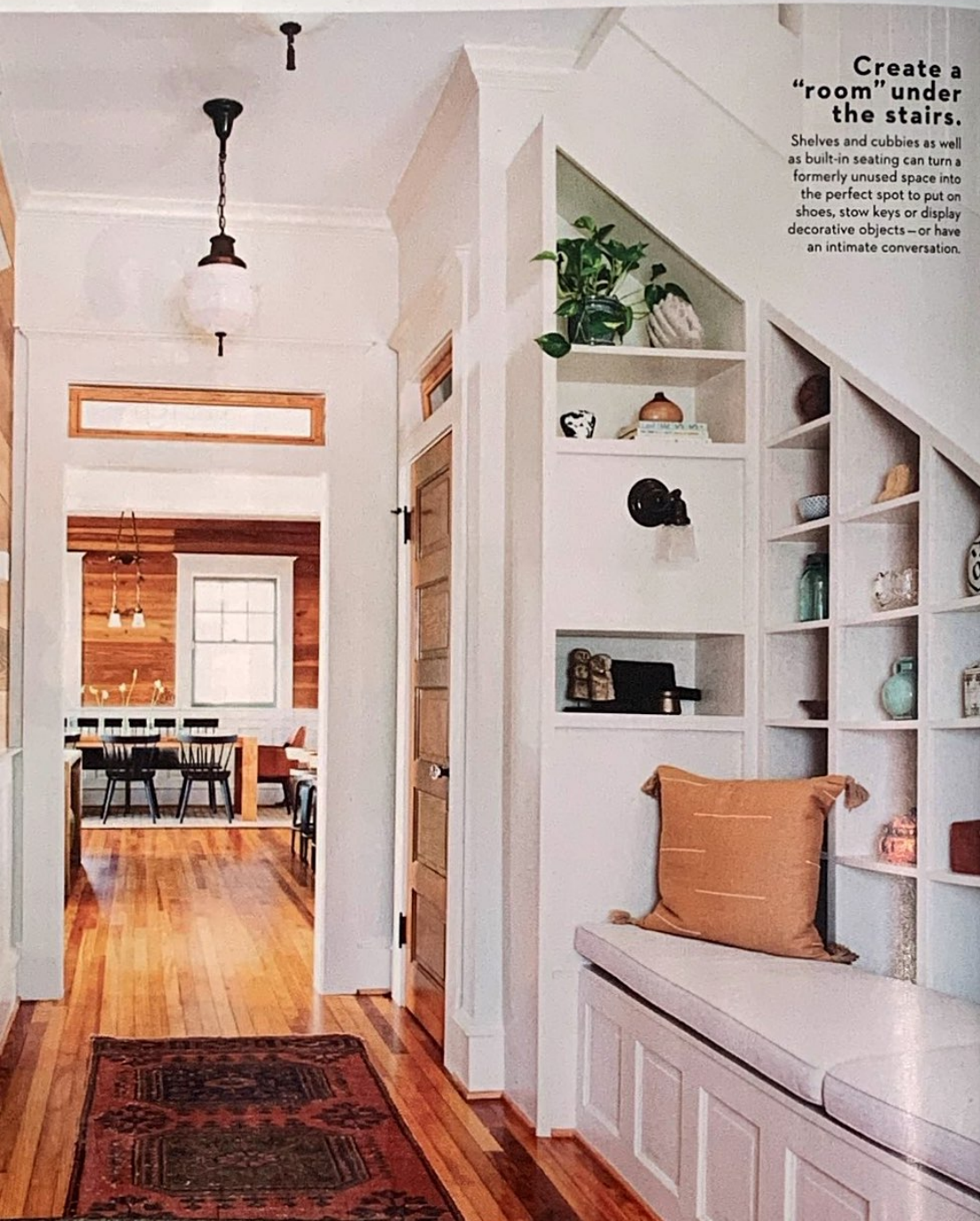
Design: Elizabeth Krueger Design. Art: Michael Kaseel.

Shelves and cubbies as well as built-in seating can turn a formerly unused space into the perfect spot to put on shoes, stow keys or display decorative objects—or have an intimate conversation.